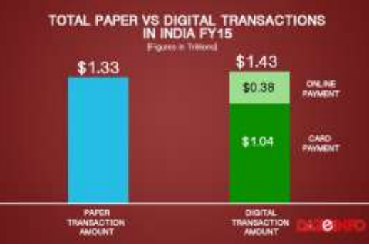
Figure 3: Digital versus paper transaction

Successful output volume: As reported by "Economics Times" the estimated digital transaction is hype on paper work. This means that there is giant smart buyer volume.